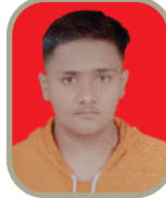
Niklank Kaslival 85.40%