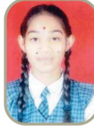
वैष्णवी चित्रक 85.00%