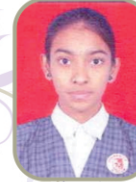
समिक्षा मेंड 85.80%