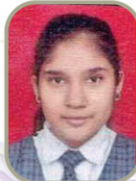
तृतीया सहाने 86.40%